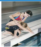
Step 2: Kneeling Position