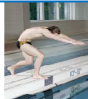
Step 3: Compact Position