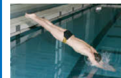
Step 5: Shallow Dive