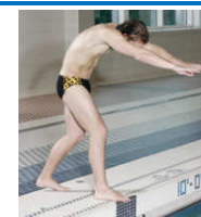
Step 4: Stride Position